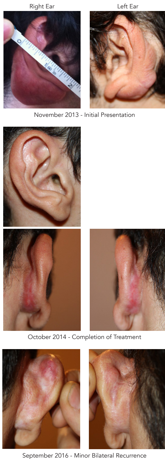
FIGURE 4: Before and After images of a patient with post-otoplasty keloids, depicting the timeline from initial presentation to completion of treatment in less than one year. Minimal recurrence is noticed in upper pole of both ears 23 months after completion of treatment.