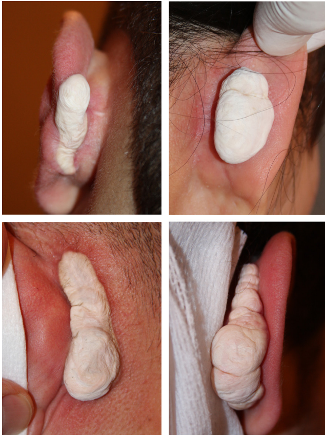
FIGURE 2: Frozen Keloids Appear White in Color.