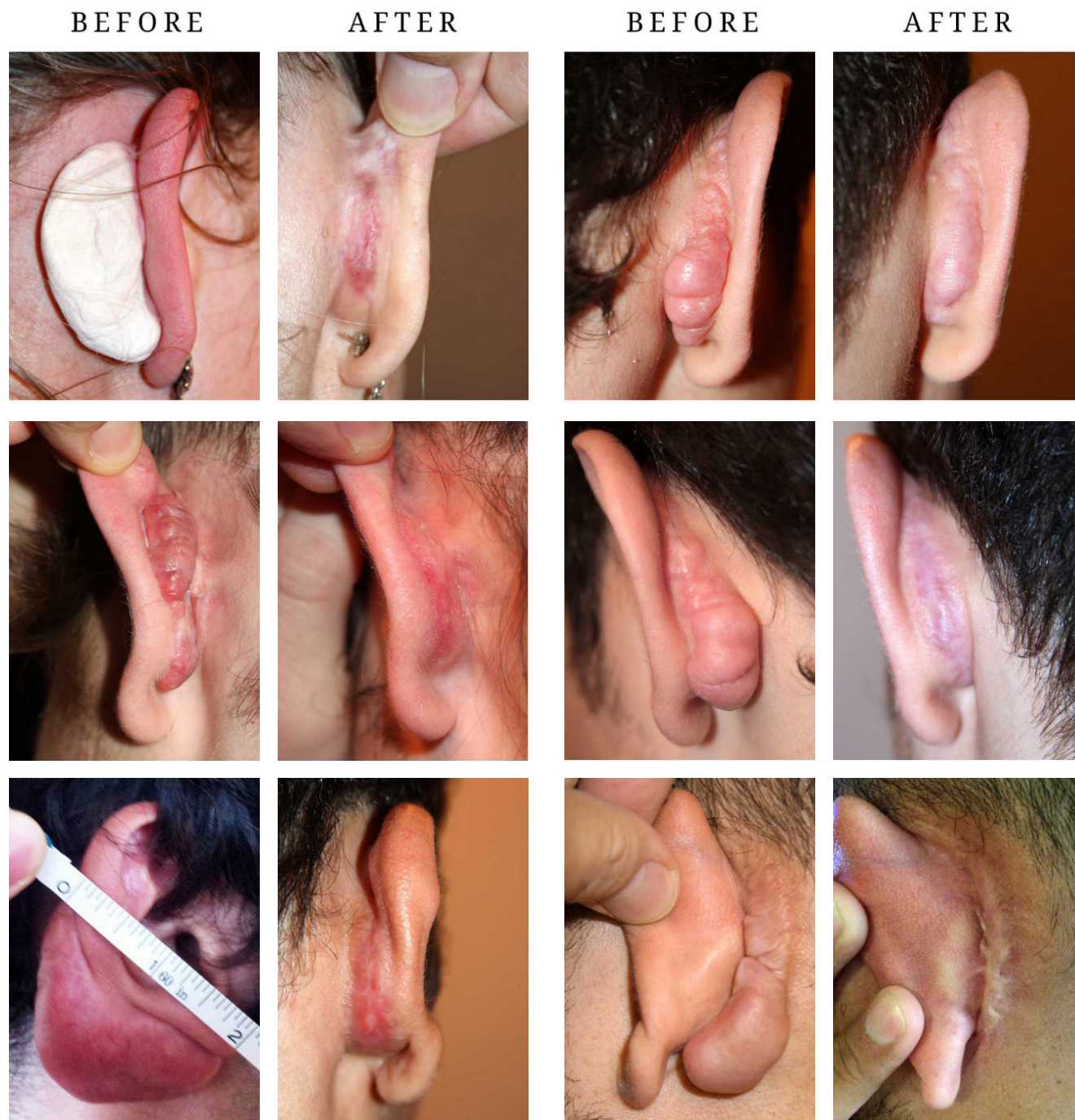
FIGURE 3: Before and After Images.

Shown are various degrees of success in treating post-otoplasty keloids with cryotherapy. Frozen keloid appears white in the ear depicted in top left image. Time from presentation to achievement of the results ranged from 6–22 months.