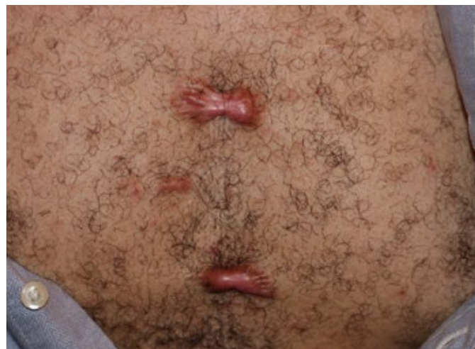
Figure 4. Locally-advanced scalp keloids in a 40-year-old male with numerous acne keloidalis lesions and multiple chest keloids.