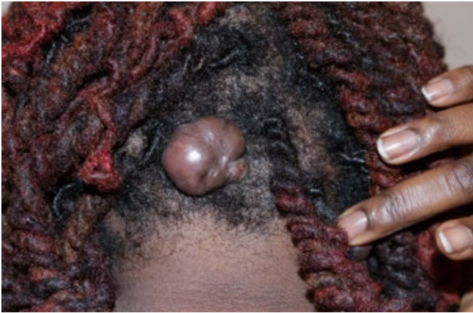
Figure 14. Tumoral scalp keloid in a 31-year-old African American female