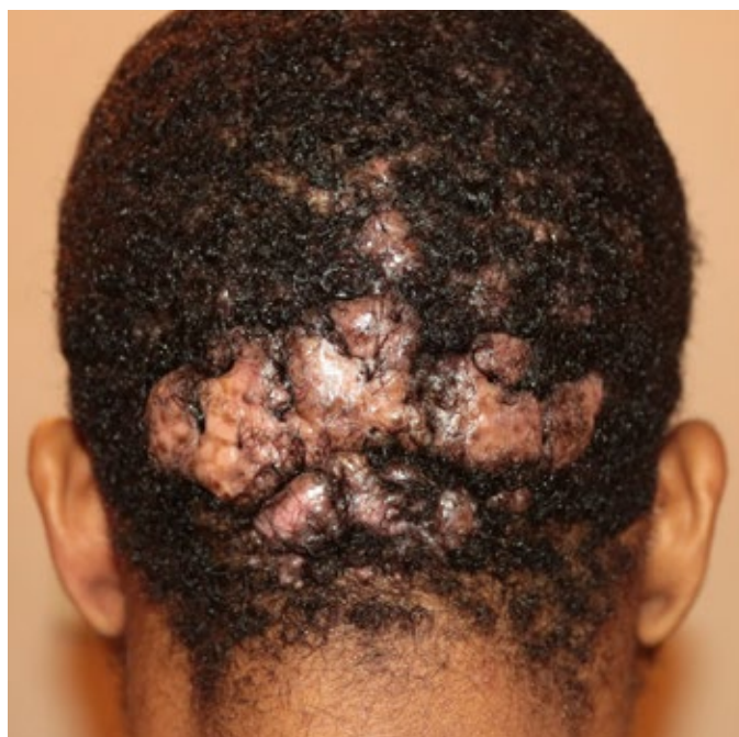
Figure 13. A 25-year-old male with widespread multinodular / tumoral keloidal involvement of scalp. His first scalp keloid had formed at age 20 for which he had received multiple ILT injections. Notice the multifocality of the disease process. Managing this type of scalp keloid is extremely difficult. Patients like this young man are in need of systemic treatments.