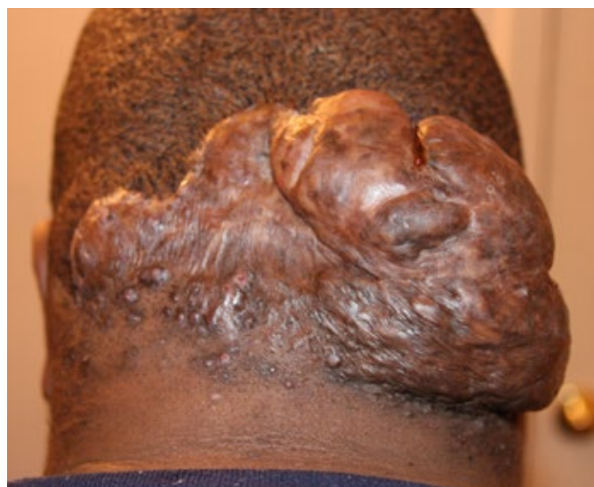
Figure 19. The same patient shown in Figure 11, three years later. The disease had progressed in all areas of his scalp.