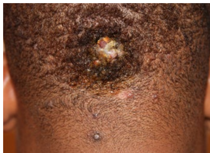
Figure 6. 35-year-old African American male with recurrent patch of scalp keloid following surgical removal of smaller scalp keloid lesions.