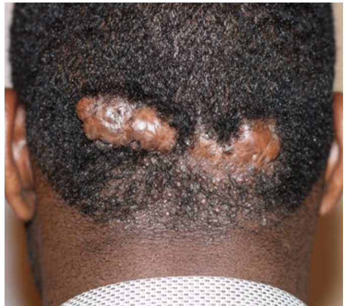
Figure 10. Locally-advanced flat occipital keloid lesions surrounded by numerous papular lesions. Treating the disease at this stage is rather challenging. Ideally, this occurrence should have been prevented with a rigorous early intervention program. Cryotherapy should be used to debulk the keloid masses. Topical steroid lotions should be used for treatments of papular component of the disease.