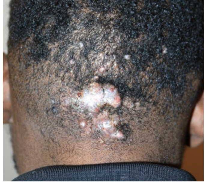
Figure 9. A 25-year-old male with a locally-advanced nodular form of upper neck, lower occipital keloid disorder. The keloid lesions had failed to respond to ILT.