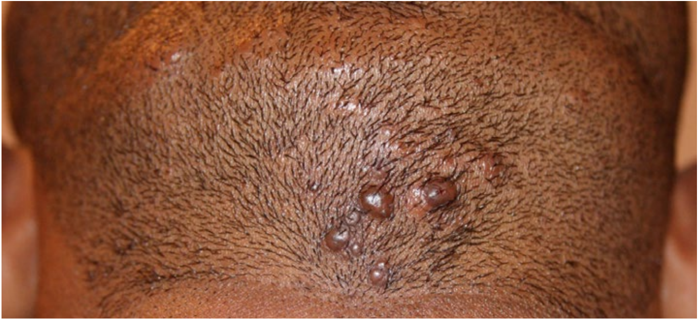
Figure 3. Early-stage involvement of occipital scalp with keloid disorder presenting with several small and large protruding papules, with some growing to become nodules.