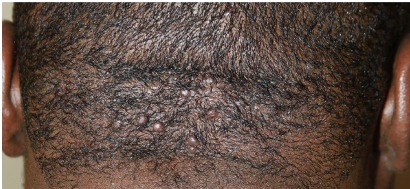
Figure 1. Early-stage involvement of scalp with keloid disorder presenting with several small protruding papules clustered in the occipital area. This patient also has multiple facial keloids that pre-dated the development of his scalp keloids.