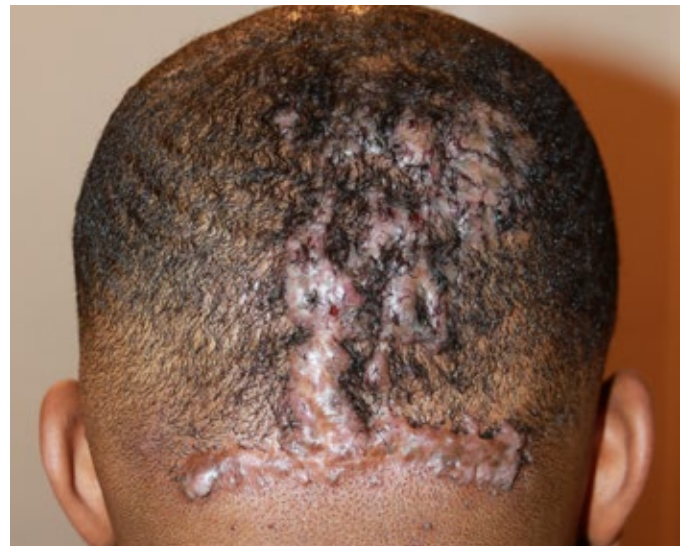
Figure 17. A 31-year-old African American male with diffuse keloidal involvement of the scalp which was made worse after keloid removal surgery

Figure 18 depicts a 40-year-old male who presented with multifocal keloidal involvement of the scalp. His scalp keloid had first formed six years earlier. He had been treated with ILT, then surgery followed by radiation therapy. Despite all these efforts, a massive keloid had formed at the site of his last surgery. It is needless to say that treating patients who present with such advanced scalp keloids is very challenging.