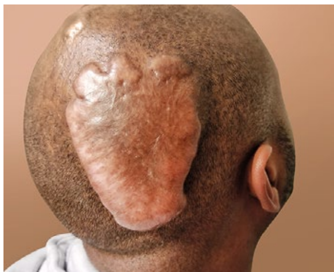
Figure 18. A 30-year-old male with superficially spreading, multifocal flat keloidal involvement of scalp. His scalp keloids had started at age 28 and had been treated with repeated ILT injections.

multiple rounds of ILT and multiple attempts at surgical resection of his scalp keloids.