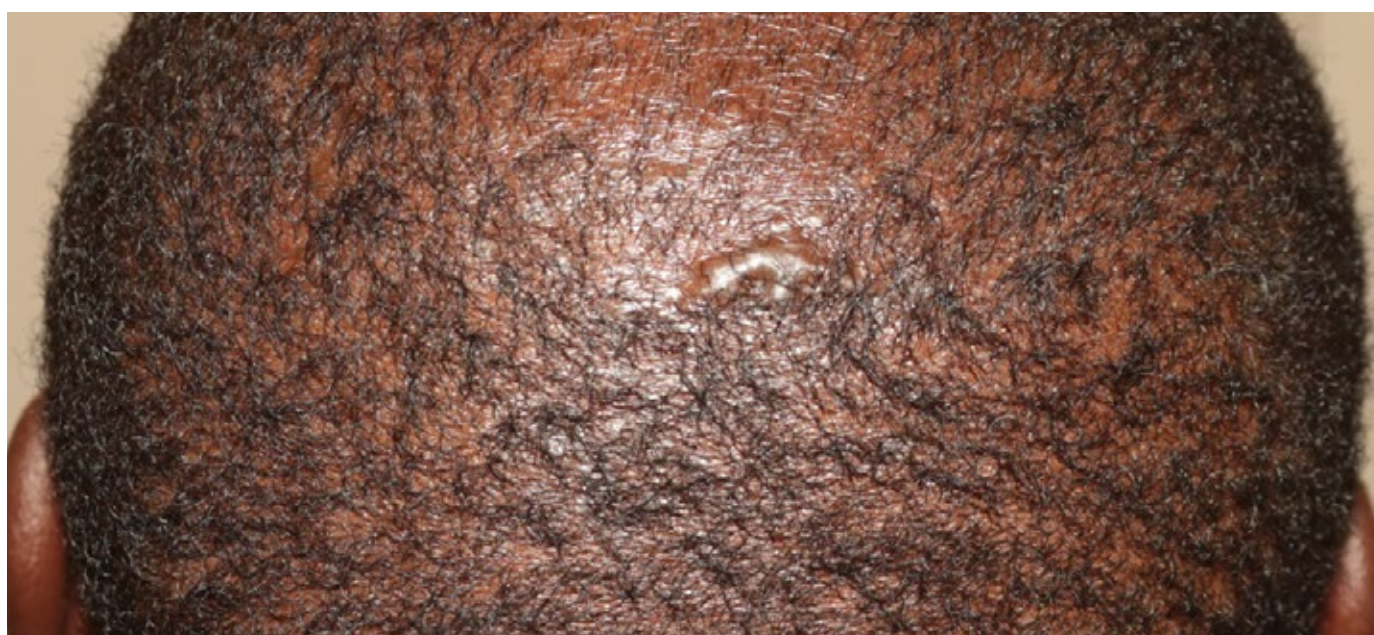
Figure 2. Early-stage involvement of scalp with keloid disorder presenting with a linear lesion in a 32-year-old male patient who has other keloid lesions on his face.