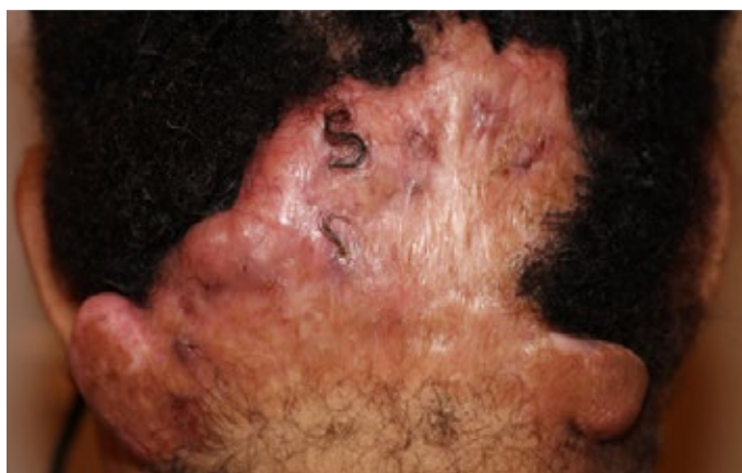
Figure 20. Several more examples of massive and a case of super-massive tumoral keloids in patients who had had prior surgery for removal of smaller scalp keloids.