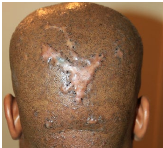
Figure 12. The same patient shown in Figure 11, three years later. The disease had progressed in all areas of his scalp.