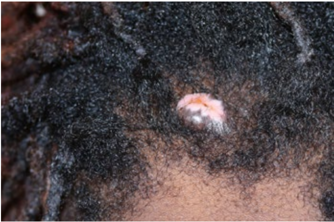
Figure 15. The same patient shown in Figure 14 one month after application of cryotherapy. Significant debulking was achieved with a simple out-patient procedure. With repeated cycles of cryotherapy, the lesion will further improve. Partial reduction in the mass of the keloid tumor was enough to allow this patient to sleep better at night.