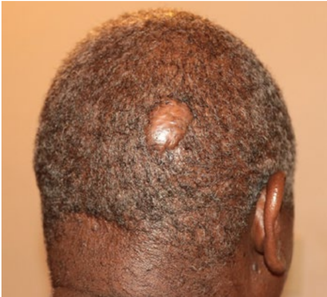
Figure 7. A 60-year-old male locally-advanced flat keloid patch of scalp. There was a 9 year history of scalp keloids and no other keloids elsewhere on his skin. The keloid had been previously treated with ILT but had continued to grow.