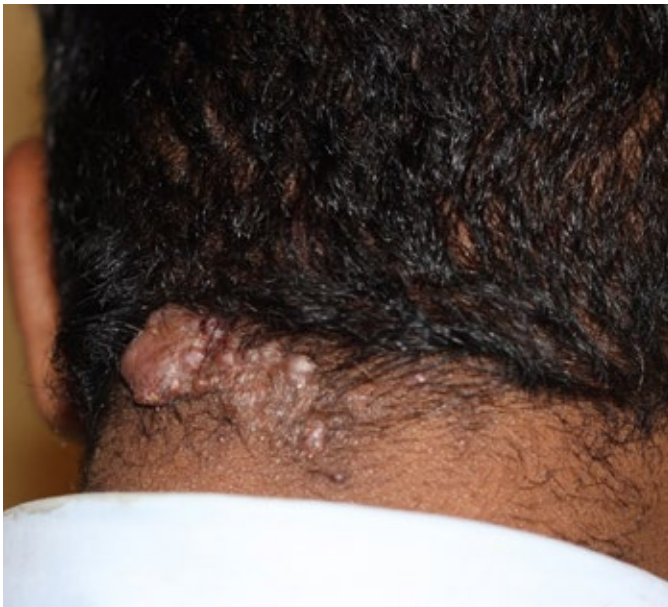
Figure 8. A 37-year-old male with a locally-advanced papular form of upper neck, lower occipital keloid disorder. The keloid had not responded to ILT. Cryotherapy and topical steroid lotions are the treatments of choice for this type of keloid.