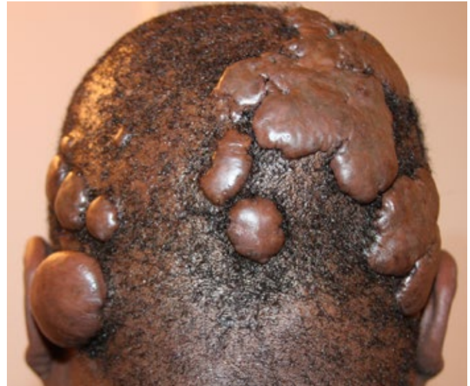
Figure 16. A 30-year-old African American male with multiple tumoral keloids of the scalp.

advanced despite all these treatments. Treating patients like him is very difficult. Our aim shall be to avoid causing such worsening of keloids by using invasive procedures.