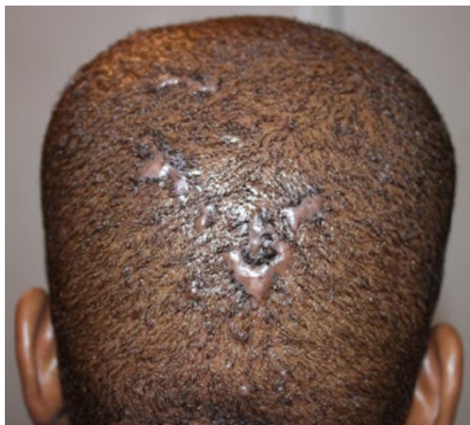
Figure 11. A 30-year-old male with superficially spreading, multifocal flat keloidal involvement of scalp. His scalp keloids had started at age 28 and had been treated with repeated ILT injections.