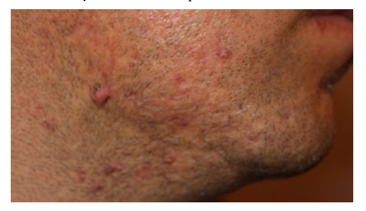
Figure 8. The same patient, small papular facial keloids on the right side of the face at presentation.

Figures 9 -11 depict the response that was achieved following treatment with a combination of ILT and cryotherapy. This intervention resulted in a change in the biology and behavior of the disease that for 11 years had caused a constant inflammatory reaction and frequent local infections.