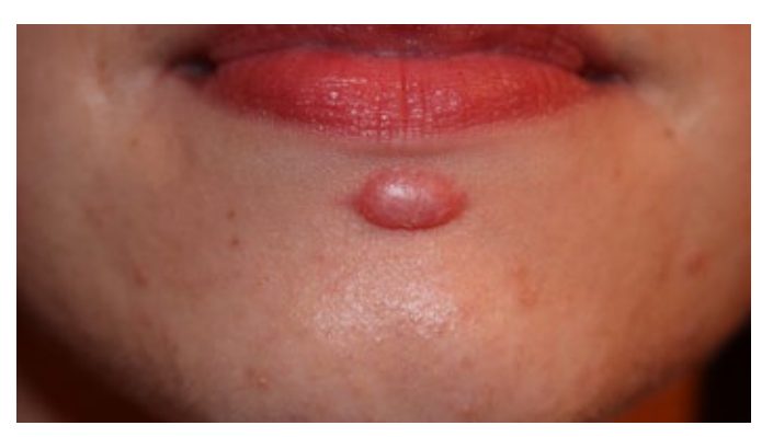
Figure 12. Nodular facial keloid in a 28-year-old Caucasian female.

A 28-year-old Caucasian female presented with a two centimeter keloid on her chin (Figure 12). She had a scar on her chin that had been excised about a year earlier. That procedure triggered formation of a keloid, which had been removed twice surgically, yet it regrew after each surgery. Her last keloid removal surgery