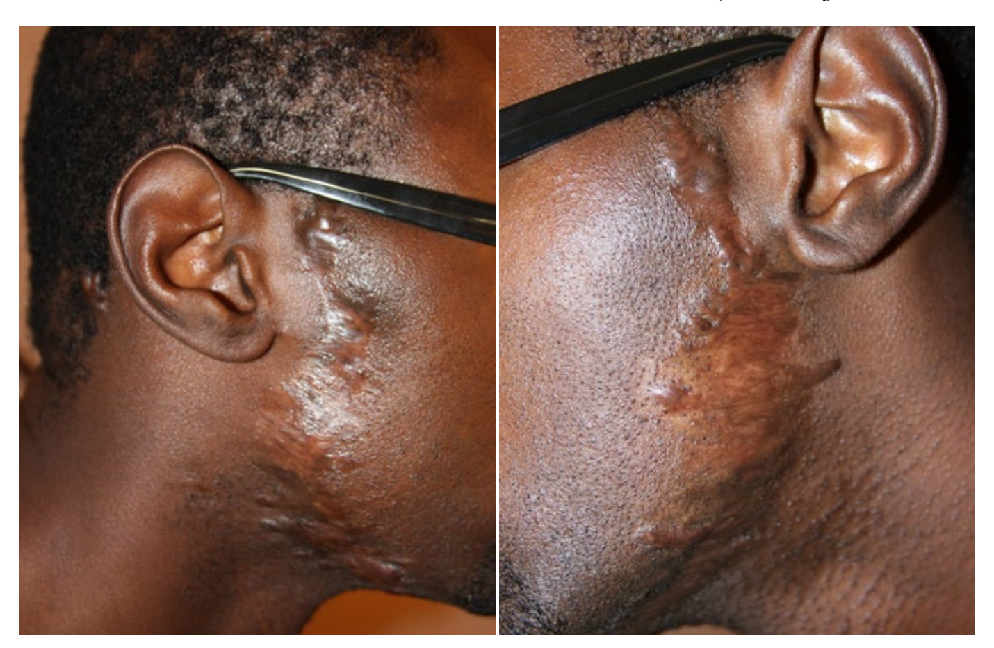
Figure 26. Recurrent keloids along the surgical excision lines.

In late 2008/early 2009, at the age 29, he underwent a series of three surgeries to remove the massive keloid that had formed on his face and neck (Figure 27). Each surgery was followed by adjuvant radiation therapy. Post operatively, he had also received several injections of high dose ILT.