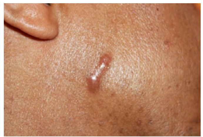
Figure 3. Early-stage linear keloid in a young African-American male.

a dynamic pathophysiology and while the triggering factors are still active – with the passage of time while the triggering factors are still present and active - most patients are destined to develop new lesions, either in the same vicinity or elsewhere on the face, or distant parts of the skin. It is naïve to think that the keloid process is static, or is limited to only one segment of the face such that it can be surgically treated.