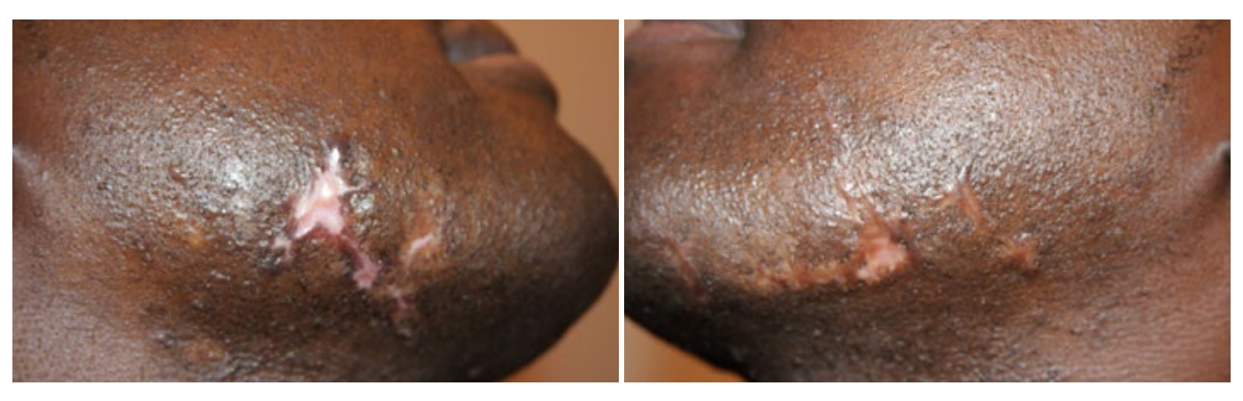
Figure 21. 18 months after initial presentation (July 2014). Treatment with ILT and cryotherapy was repeated every few months to manage early recurrence and other new lesions that formed in that time frame.