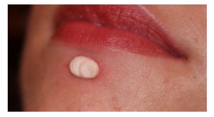
Figure 13. The same patient, immediately after application of cryotherapy. The frozen keloid appears white.