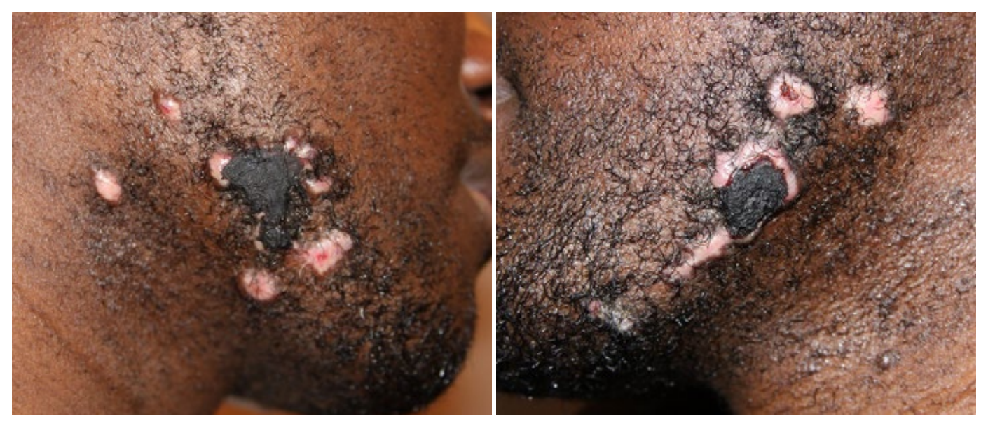
Figure 20. Treatment results shown three weeks after the first cycle of ILT and cryotherapy. Depending on the size of the treated lesions, the scabs remain in place for 2-6 weeks after cryotherapy before they slough off.

In March 2018 after a 14 month gap in treatment, the patient presented with several areas of regrowth and new keloid formation on his face (Figure 22), mostly outside the previously treated areas. Once again, the recurrence was treated, and responded to repeated cycles of ILT and cryotherapy (Figure 23).