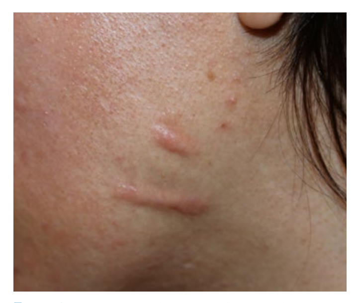
Figure 5. Early-stage, yet bulky linear facial keloids in a young Asian female.