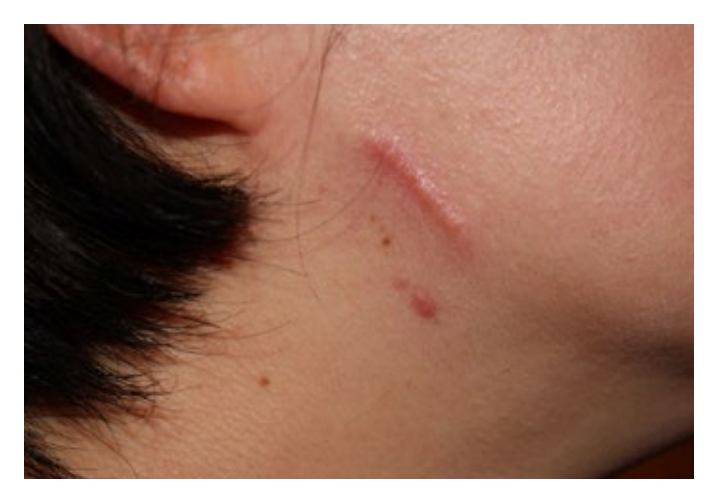
Figure 2. Early-stage linear keloid in a young Asian female.