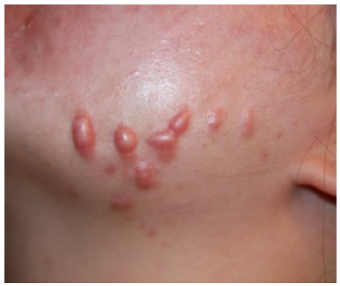
Figure 6. A 25-year-old Asian female with progressive early-stage facial keloids. Notice presence of the papular and nodular lesions