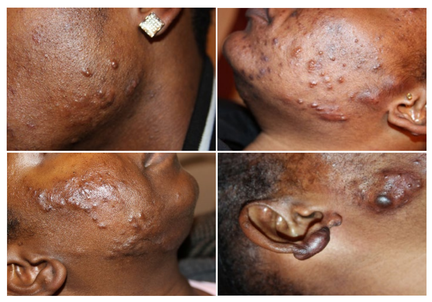
Figure 4. Multiple raised keloid papules/early nodules among young African-American females. Notice multifocality of the disease process.