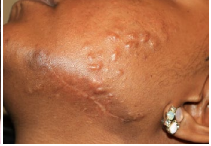
Figure 32. A 20-year-old African-American female presented with early recurrence at the site of prior surgery. A year earlier at age 19, this young woman was treated with surgery followed by radiation therapy to remove a portion of her facial keloid. Recurrence at the excision site was noticed within 9 months of surgery. This case depicts the totally inappropriate approach to treatment of this young woman. Performing surgery to partially debulk a multifocal disease and exposing a 19-year-old patient to radiation therapy does not achieve much, except for putting the patient at a risk forming a massive keloid at the site of surgery. Exposing young patients to radiation therapy puts them at risk of developing cancer in the future [3-4].